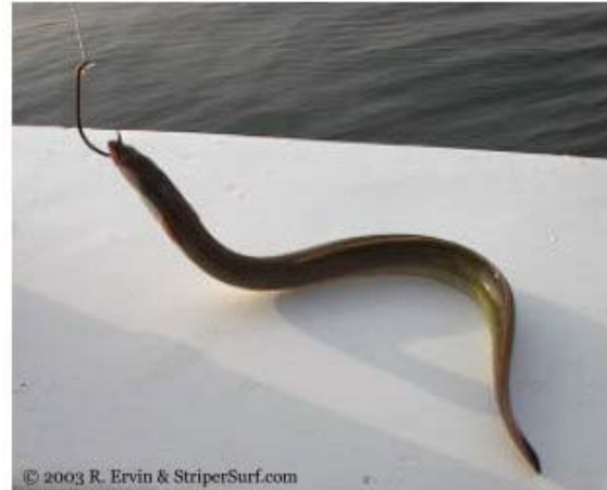
American Eel Anguilla rostrata

Now it's time to start fishing. There are several methods of hooking an eel. One method is to run the point of the hook through one eye and out the other. This way you have the support of the skull when you cast your eel. Another method is to place the point of the hook into the eel's mouth and bring it out through one of the eyes. My personal favorite method of hooking an eel is to place the point of the hook as deeply into the eel's mouth as possible and bring it out through the bottom of the throat. The disadvantage of this is that the soft tissue tears more easily and you might lose a few more eels when casting, but not a significant number. The advantage is that the eel will stay lively longer and you can hide more of the hook shank in the eel's mouth so as to be less noticeable to your prey.